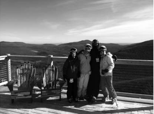
Mittkidz on top of Hunter Mountain