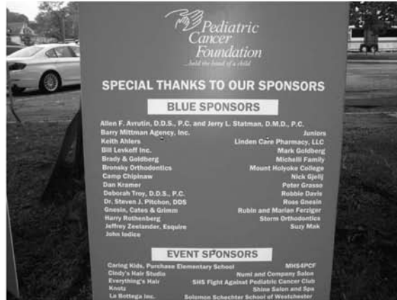
Sponsorship Board at the Bikeathon